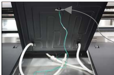
Location of pan sensor found on the bottom of the center deck pan in the display case.