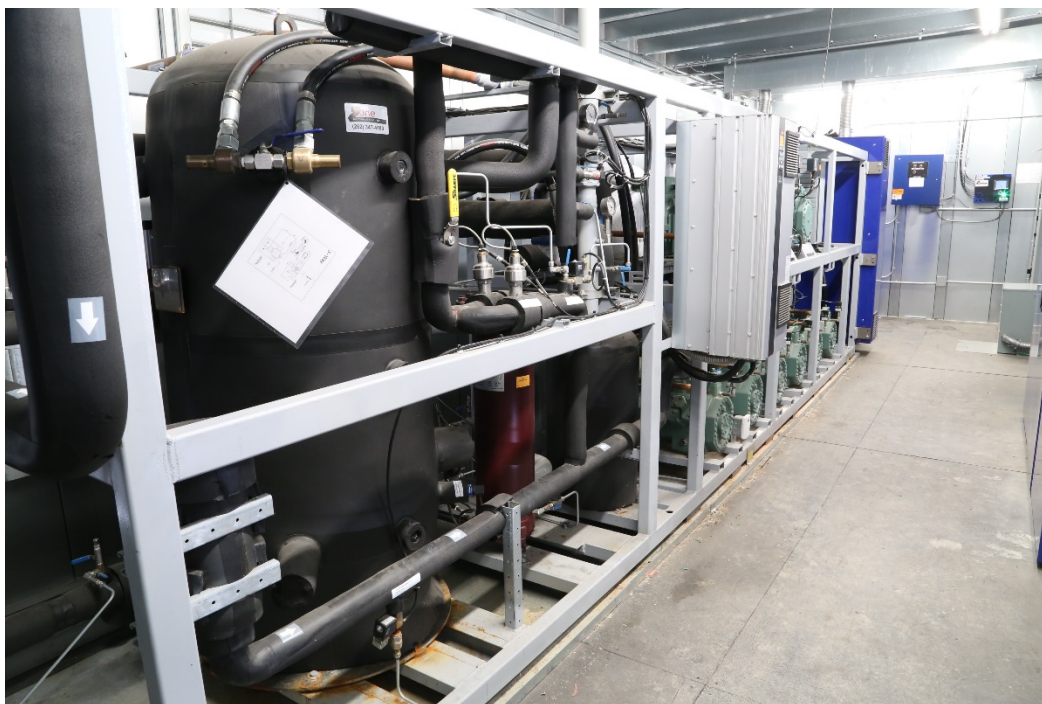
Figure 4: Hillphoenix Advansor CO 2 Transcritical Booster System

Frank introduced the idea of using an Advansor CO 2 transcritical booster system ( figure 4 ) from Hillphoenix to accommodate Best Food Services refrigeration needs.