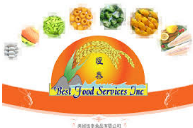
Figure 1: Best Food Services

unstoppable, don't fall prey to the folly of attempting to change their direction; they adjust their sails instead to take advantage of the change and accelerate their business forward. They take the bold stance that the winds of change can be welcome, pushing you to a better place. There is no finer example of this principle in action than the story of Best Food Services, a national food service wholesaler headquartered in the Chicago area and focusing on the Chinese market with dry goods, cleaning supplies, refrigerated produce, fresh meat, frozen seafoods and frozen appetizers.